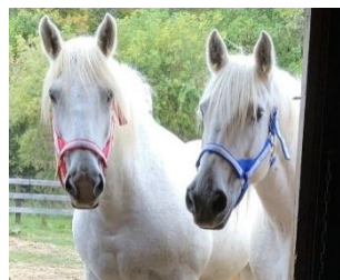
Princess and Boomer

Boomer has been in classes already and is learning how to make friends in the herd. Princess is working on getting used to the mounting area and procedure before she joins classes. She has settled in great with the other mares.