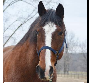
Garth, getting ready to retire!

After many years of service, our beloved Garth will be retiring at the end of Session 7. Those of you who would like to say goodbye, and maybe bring him a special treat, may do so December 12-14 between 2 and 6pm. He will be in the barn ready to get love from anyone and everyone who wants to say, "Thank you" and "Goodbye." Garth will be returning to his owner, who is happy to have him back with her.