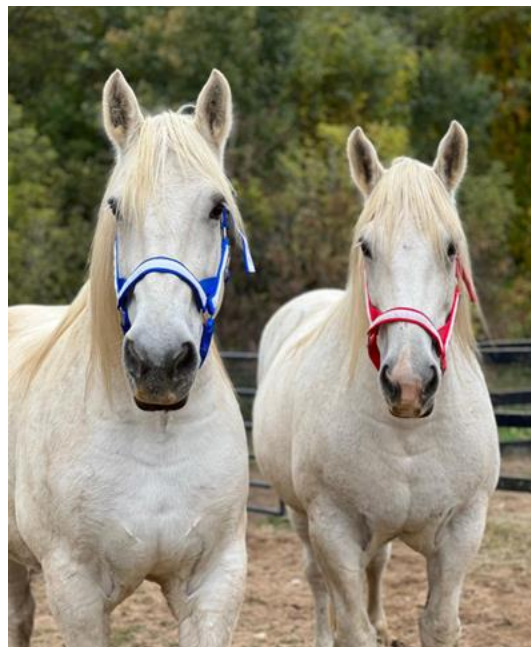
Percheron pals Boomer and Princess

Bonus fact: Boomer and Princess have participated as demo horses in the Michigan Horseshoers Association annual clinic and contest, held each January at Michigan State University.